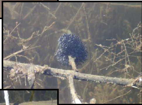
Northern Leopard Frog Egg Mass