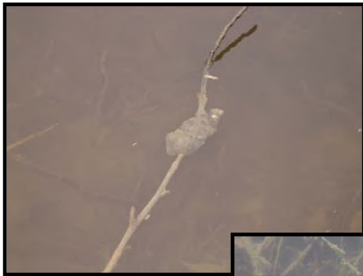
Spotted Salamander Egg Mass

This demonstration project has confirmed that the planned approach can be successful at creating new wetland habitat including amphibian breeding pools, and provided insight for optimization of pool construction in the future